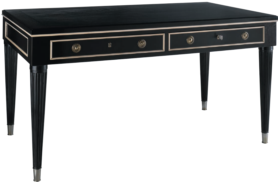
DK 602 Le Dix Desk